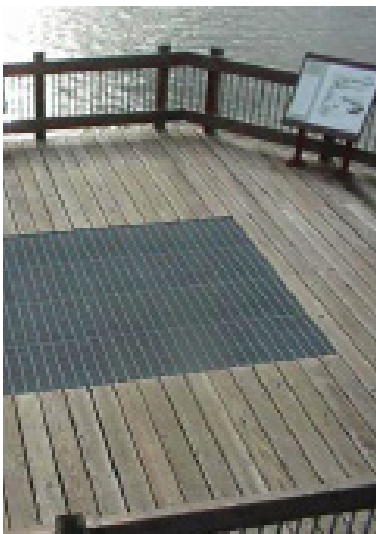
Dock with metal grating