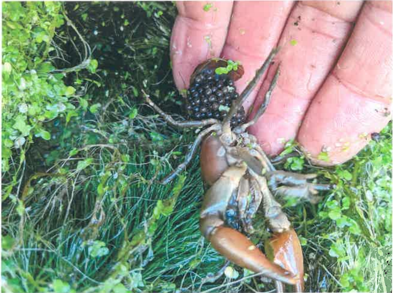
Signal crayfish ( Pacifastacus leniusculus ), female with eggs.