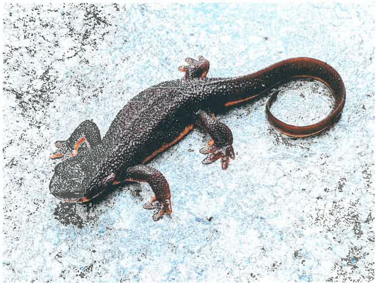
Roughskin newt ( Taricha granulosa).