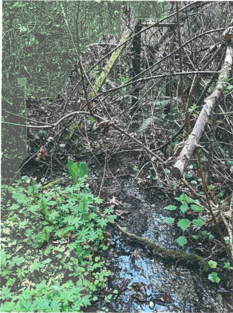
Year-round stream at NE corner of Parcel #0222327017 and SE corner of subject property.