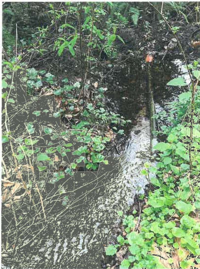
Catchment basin at stream with low impact diversion of a small portion of water to the pond of Exhibit A as installed by previous property owner circa. 1970s.