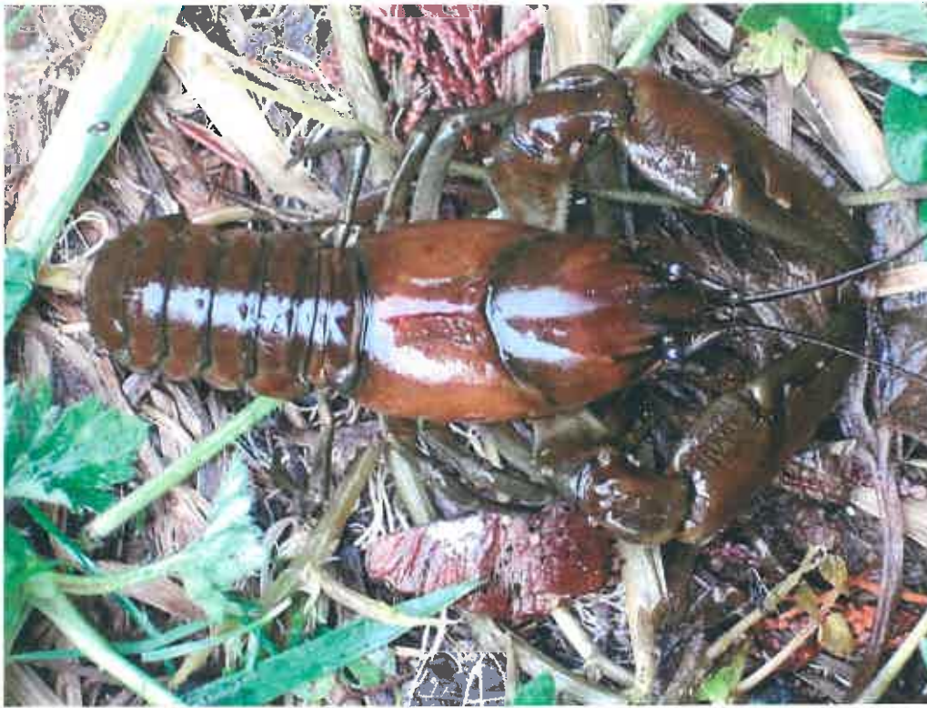
Signal crayfish ( Pacifastacus leniusculus ).