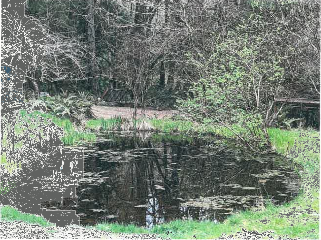
Pond (sanctioned by Pierce County Planning Department) on parcel #0222327017.