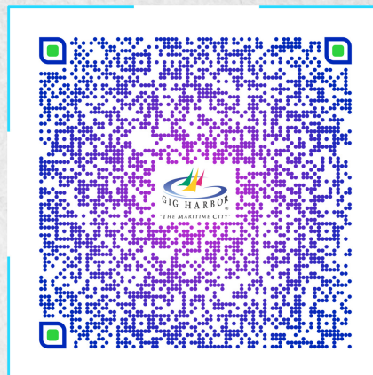
See Click Fix

You can add a request directly on the city's website or scan the QR code