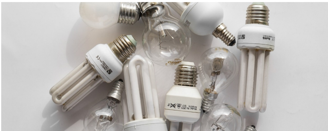
Figure 3: Some used light bulbs are classified as dangerous waste.