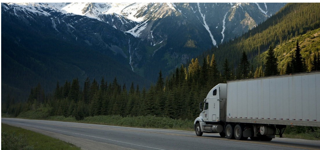
Figure 6: Safely ship your dangerous waste by using a permitted transporter.

It is your responsibility to choose a hazardous waste transporter. Use a permitted transporter with a valid EPA/state ID number. Selecting a company that is financially able to respond to accidents is important; it is your responsibility to ensure your dangerous waste is properly disposed of.