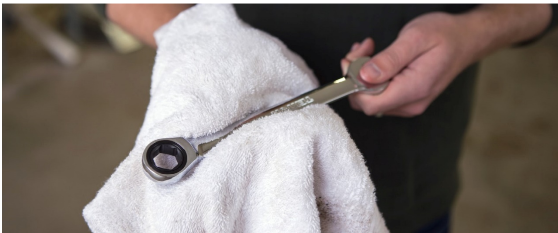
Figure 2: Shop towels can be designated as dangerous waste.