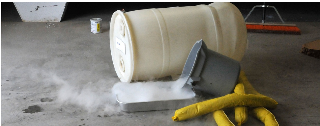
Figure 7: Report all dangerous waste spills immediately.

You must report any spill that endangers human health or the environment, regardless of size. Post emergency contact information near your dangerous waste accumulation areas. Report significant spills and releases to each of the following: