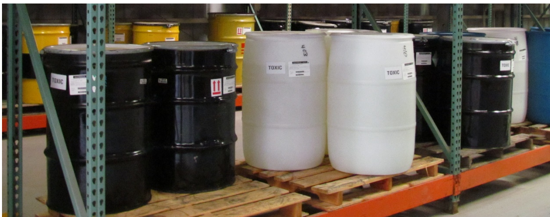
Figure 5: It's your responsibility to inspect your dangerous waste containers regularly.