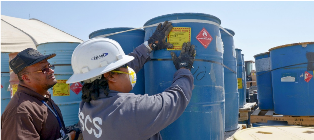
Figure 1: Manage your dangerous waste properly to keep your workers and the environment safe.

Additional information on proper dangerous waste management may be found at the Department of Ecology's Hazardous Waste and Toxics Reduction (HWTR) Program website . 1