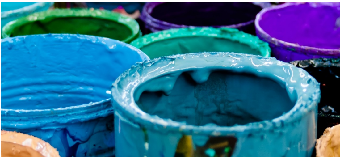
Figure 4: Follow Ecology's recommendations to reduce your paint waste.

Solvent-based paint wastes are usually dangerous waste. These include thinners, cleanup solvents, and waste paints. Some latex and acrylic water-based paints are also dangerous waste. Containers for these wastes must be properly labeled and kept closed when not in use. The waste must be accumulated, counted, and reported according to the dangerous waste regulations.